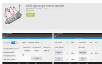
USG Android APP