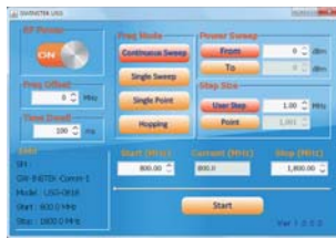
Easy to Use Graphical Interface with Numeric Setting