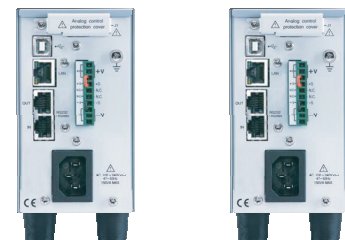
PFR-100L Rear Panel PFR-100M Rear Panel