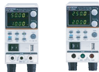
PFR-100L Front Panel PFR-100M Front Panel

The PFR-100 series provides special functionalities to meet test requirements for different load's characteristics. The CC priority mode can be applied for DUTs with diode characteristics to prevent DUT from being damaged by inrush current. A slow rise time for voltage can also protect DUT from inrush current, especially for tests on capacitive load. When power is off or load is disconnected, the activation of Bleeder circuit control will allow the bleeder resistor to consume filter capacitor's electricity. Without the bleed resistor, power supply's filter capacitor may still have electricity that is a potential hazard. For automatic testing equipment systems, the bleeder resistor allows PFR-100 series to rapidly discharge to prepare itself for the next operation.