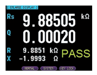
ENLARGE Display Enlarge Measurement Results and Include PASS/FAIL Judgment

The measurement result display of the LCR-6000 series not only reveals major and secondary measurement parameters but also includes two monitoring parameters. Therefore, four DUT related parameters can be simultaneously shown on the display screen to save time if repeated measurements are required. With respect to display screen, the LCR-6000 series features diverse display to meet users' observation requirements. For instance, MEAS display shows setting parameters and measurement results at the same time; ENLARGE display focuses on measurement results and PASS/FAIL judgment is available, which is conducive to assist engineers to swiftly obtain the validity of measurement results.