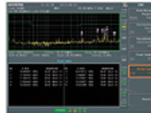
EMC Pretest Mode

GSP-9300 supports the fast sweep mode with sweep speed up to 307usec. Users can use the fast sweep mode to capture transient signals such as Tire-pressure monitoring system (TPMS), Bluetooth frequency hopping signals, tuned oscillator, and other interfering signals in ISM frequency band, etc