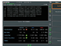
FSK Signal Demodulation & Analysis

All active components have linear dynamic range for power output. Once output power reaches the maximum level, active component will enter the non-linear saturated area of P1dB point and cease amplifying signal intensity as well as produce harmonic distortion. It is very useful for P1dB point measurement in active components such as low noise amplifier, mixer and active filter.