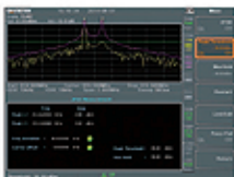
2FSK Signal Analysis

ASK/FSK demodulation and analysis measures parameters including AM depth, frequency deviation, modulation rate, carrier power, carrier frequency offset, SINAD, symbol, and waveform. Users can set AM depth, frequency deviation, carrier power and carrier offset for Pass/Fail testing result.