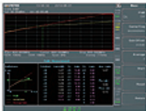
P1dB Point Measurement

EMC pretest mode is ideal for electromagnetic compatibility (EMC) test which is the preliminary stage of electronics product development. Users can identify and resolve problems at the early phase to avoid product revision after it was finalized. Hence, product development cycle and cost will be greatly reduced which is beneficial to saving cost and time for product entering the verification stage.