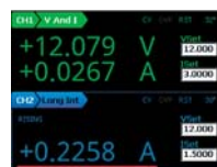
Long Integration Measurement