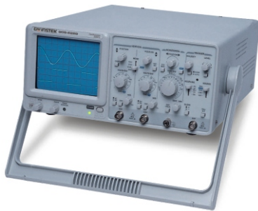
GOS-635G (35MHz) GOS-622G (20MHz)