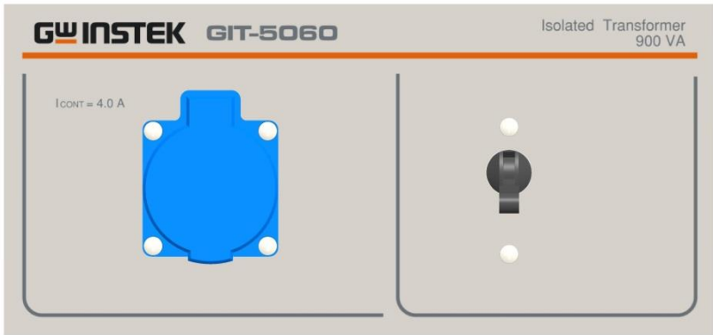
Isolated Transformer Panel